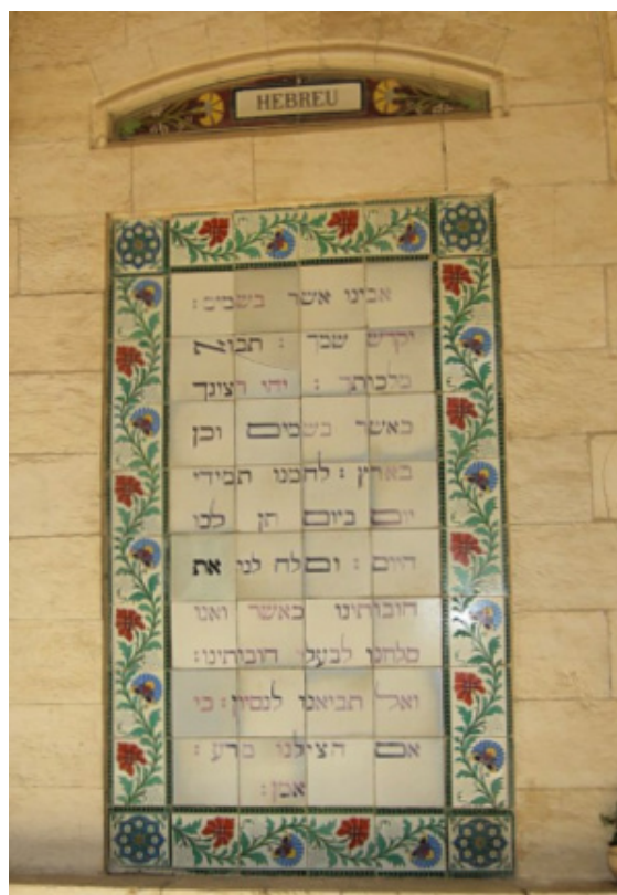
The 'Our Father' in Hebrew: Church of the Paternoster, Jerusalem

The Lord's Prayer – Andrea Bocelli https://youtu.be/u8jlmjg4UY?t=56