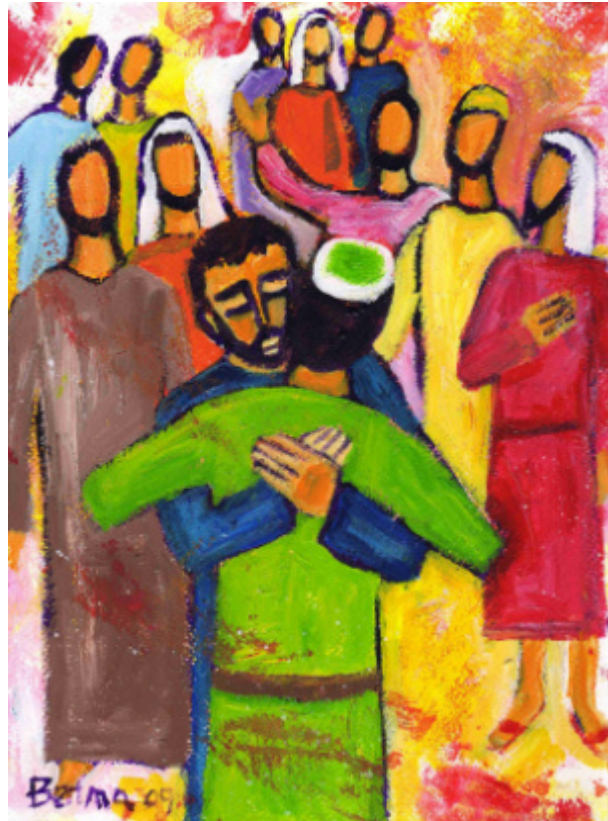
'Go reconcile with your brother' Bernadette Lopez via Qumran2.net