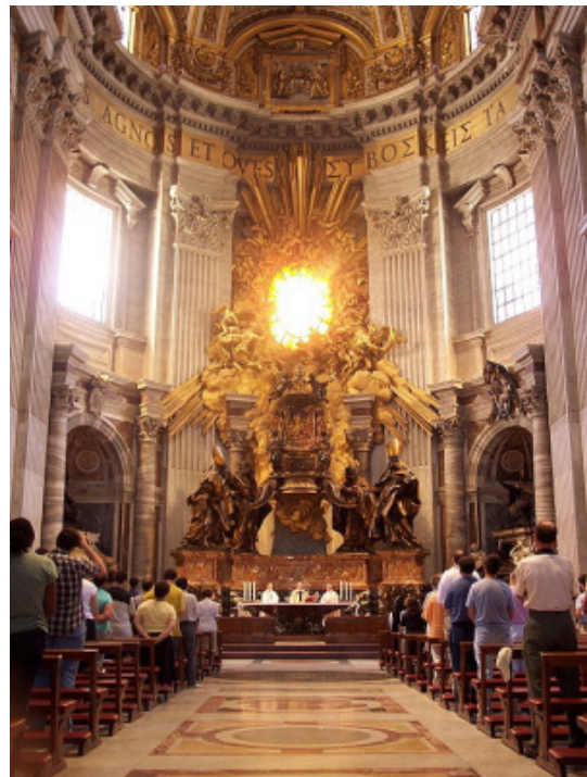
Chair of St Peter

Lord God, we offer our joyful prayers in thanksgiving for our Holy Father Francis, Vicar of Christ and Servant of the servants of God. In Pope Francis we recognize the successor to Peter, the touchstone for the mission of the Church. We pray that your Holy Spirit will strengthen him to be a messenger of love, peace and unity. We give thanks for the many gifts of the Shepherd of our church. May he please you in his holiness and guide his people with love and watchful care, especially for the sick, the poor and the vulnerable. We greet him joyfully and pledge our love and support for him. With him, we accept the invitation to spread the Good News of the Gospel in word and action. We offer our prayer through our Lord, Jesus Christ, your Son, who lives and reigns with you in the unity of the Holy Spirit, God, forever and ever. Amen.