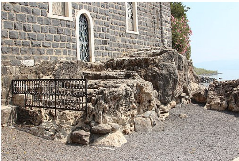
Rock and stairs from older church: Church of the Primacy of Saint Peter Fallaner, CC BY-SA 4.0 , via Wikimedia Commons

I remember one special visit to the Holy Land, when we were celebrating mass in the Chapel of the Primacy of Peter. The chapel is built on a large outcrop of rock, and this is also visible inside, in front of the main altar.