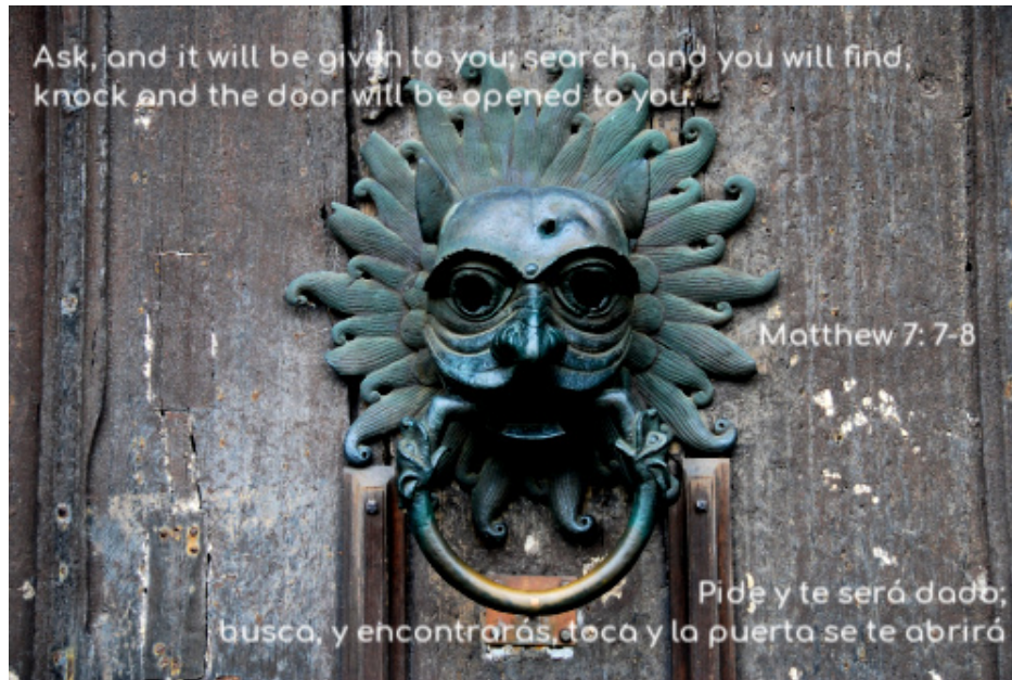
Sanctuary knocker at Durham Cathedral

one door, he opens another," the implication being that it's still up to us whether to cross the threshold. This maxim about God closing one door and opening another isn't actually in the Bible, but something like it does show up in church liturgies for Advent. There's an antiphon sung just before Christmas that celebrates Jesus as he "who opens what no one shuts, and who shuts what no one opens, who breaks down the prison walls of death for those who dwell in darkness and the shadow of death, and who delivers his captive people into freedom." Today we pray that these doors do not become a barrier to us; we pray that we have an open-door policy-that we can speak honestly and fully with our God.