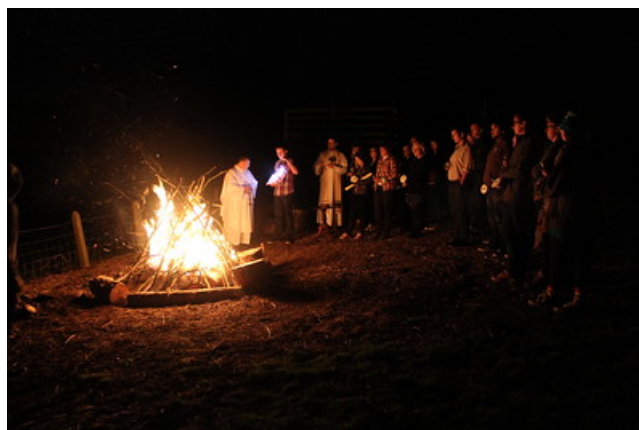
The Easter Fire of Hope Young Adults' Retreat at Savio House Bollington, Easter 2014

'Walking in the Pastures of Wonder' John O'Donohue