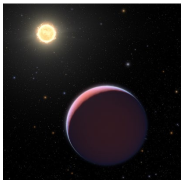
18th Jan. 2016

Thank you for being with us on our Advent Camino. A Happy and Holy Christmas to you all!