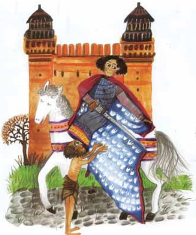
Picture of Saint Martin from the book 101 Saints and Special People.

Some bystanders laughed at him and the ridiculous way he looked, wearing only half a cloak, but other bystanders felt ashamed that this poor soldier had helped from his poverty and made a difference whilst they, with money in their pockets, had ignored the beggar completely, and they walked away challenged by Martin's actions.