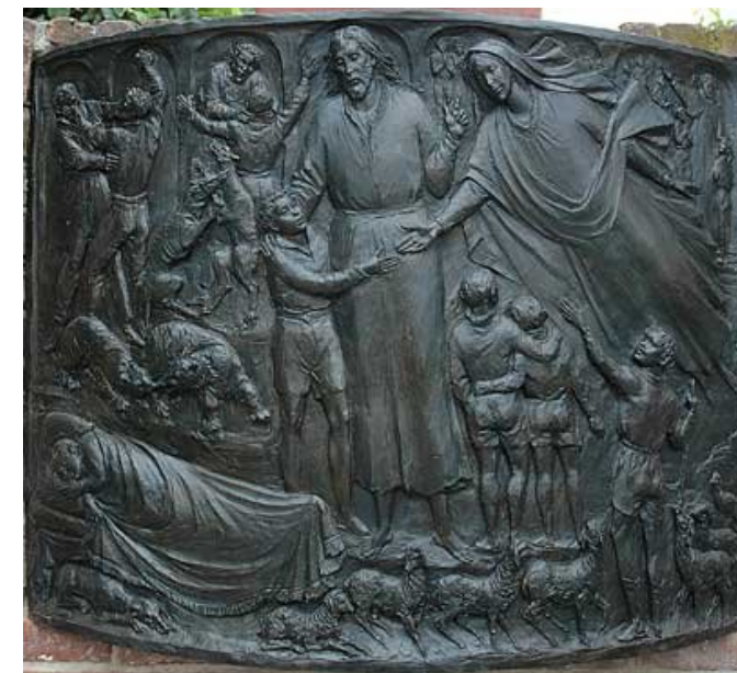
The dream at the "age of nine"