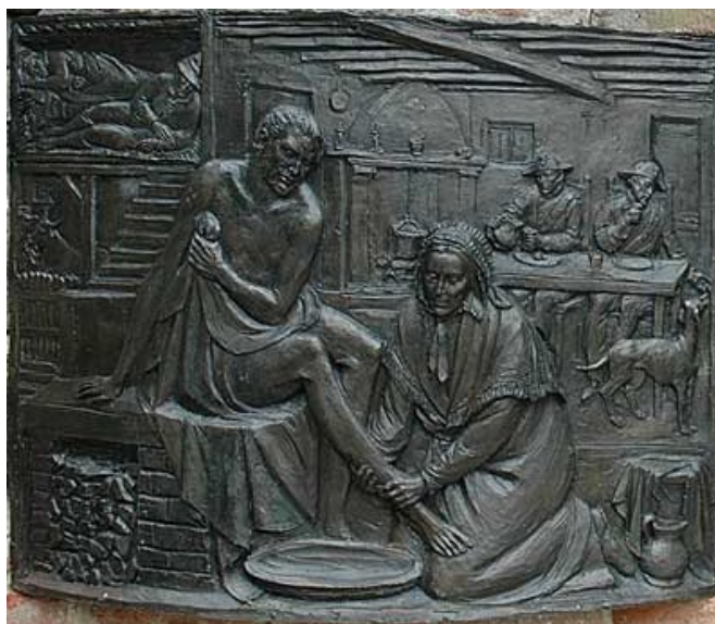
Margaret, consoler of the Sick and the Poor

Let us offer ourselves to serve our neighbors with a spirit of charity and gratuity.